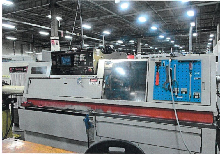
Equipment Photo: B 1290, Citizen Lathe